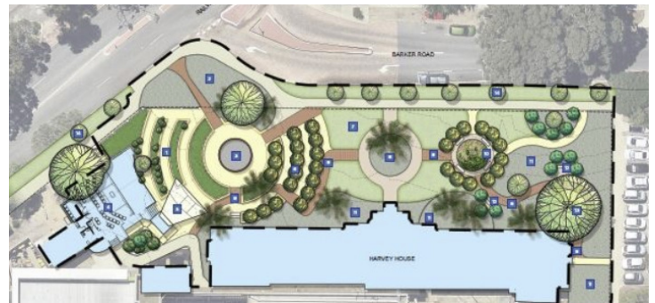
Rotary of Matilda Bay's Plan for the KEMH Rose Garden

seating and other amenities, there is an urgent need for a sympathetic refurbishment and expansion to upgrade the Garden to become a significant place for reflection, reconnection, memory and healing. The project is estimated at $1.5 million and the upgrade is awaiting State Government approval to proceed. Meanwhile, the fund raising for the project is underway with Pioneer Challenge as its major fund-raising initiative. Donations can be made at https://www.pioneerchallenge.com.au/